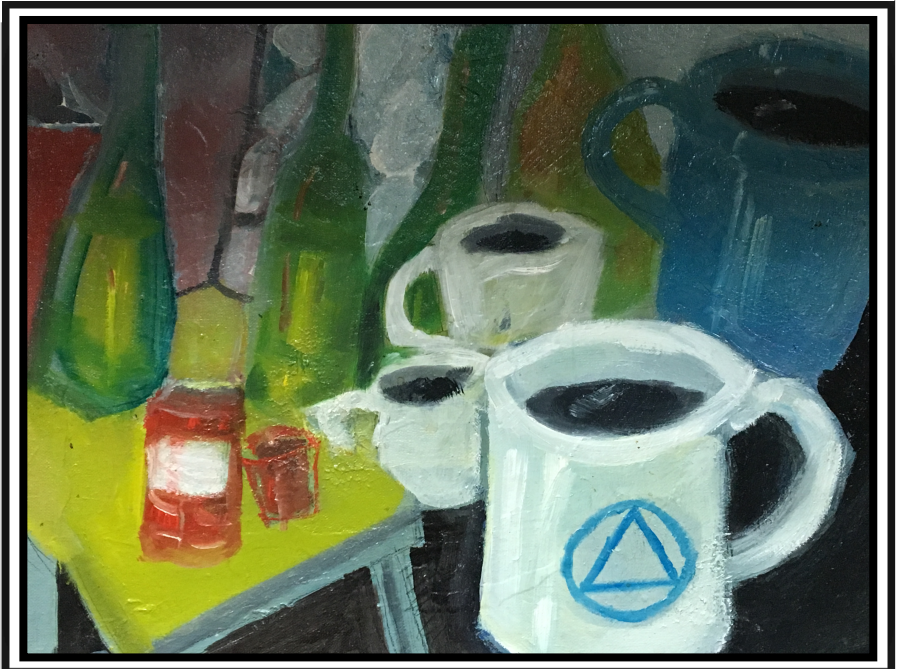
Photo of painting in the Kingwood Club

“Every service responsibility should be matched by an equal service authority - the scope of such authority to be always well defined whether by tradition, by resolution, by specific job description or by appropriate chapters and bylaws”